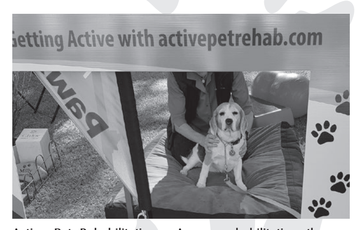
Active Pet Rehabilitation - A new rehabilitation therapy referral business available to small animal practitioners in Western Australia.

Established by Carmel Keylock RVN (W.A.), MNAVP (U.K.), employed within the veterinary profession since 1984 and now involved in the rehabilitation field, Active Pet Rehabilitation provides an independent service, working in conjunction with veterinary professionals, for canine rehabilitation following injury or disease.